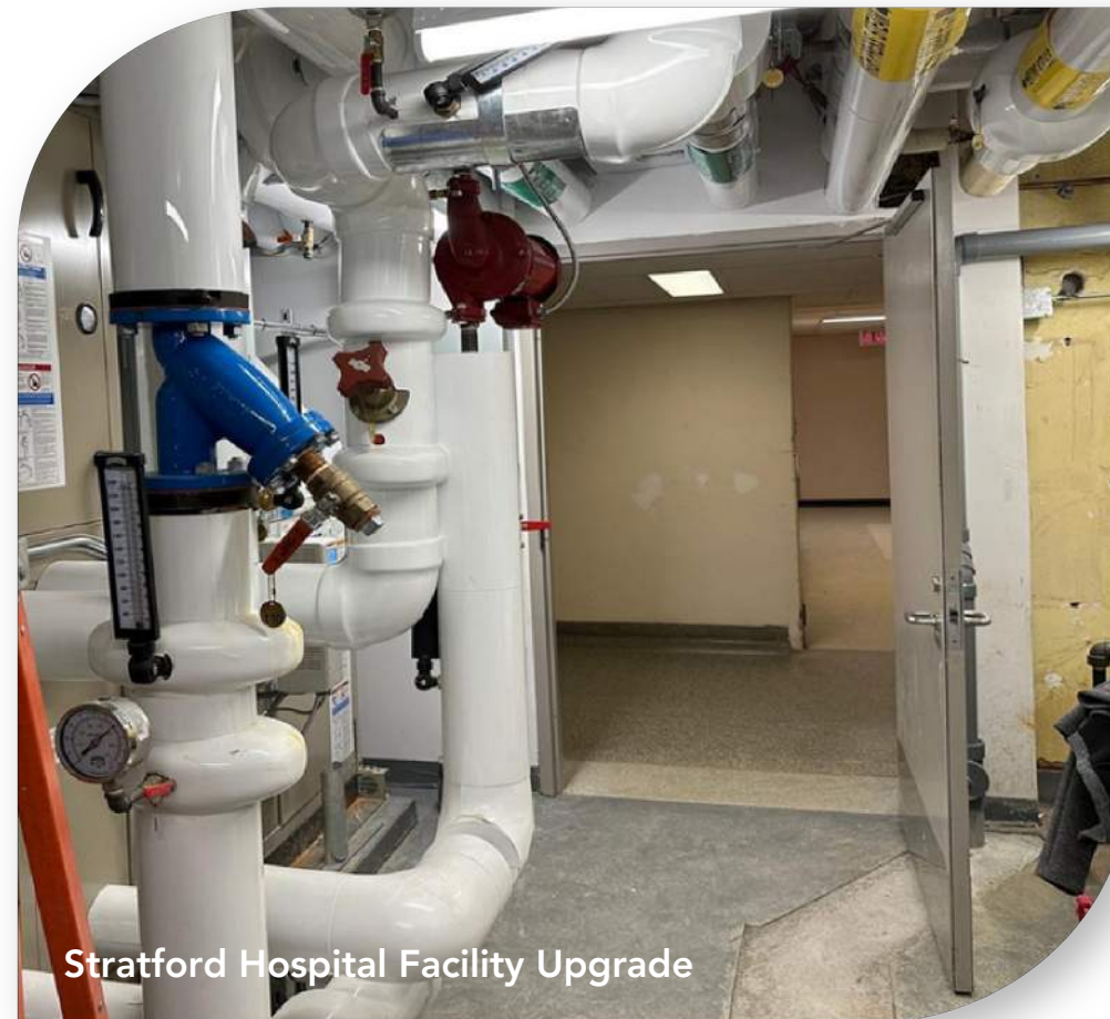
Stratford Hospital Facility Upgrade