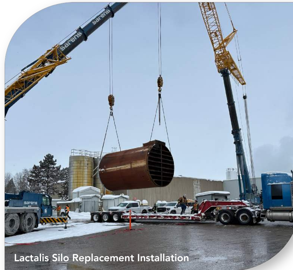
Lactalis Silo Replacement Installation