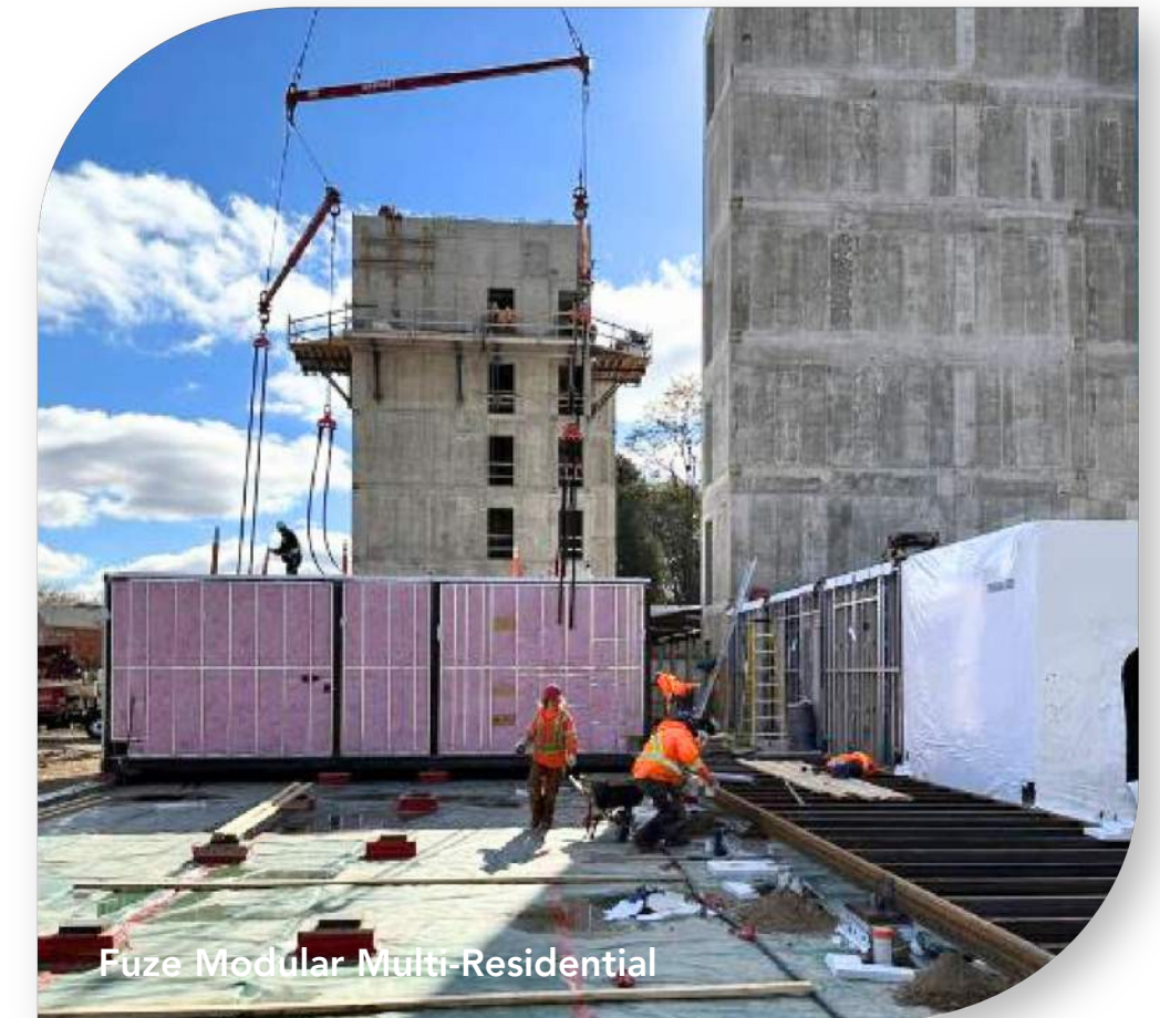
Fuze Modular Multi-Residential