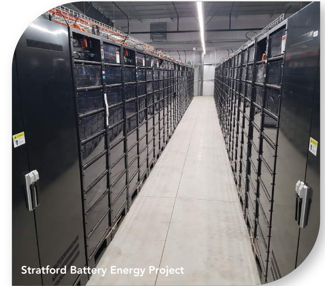
Stratford Battery Energy Project