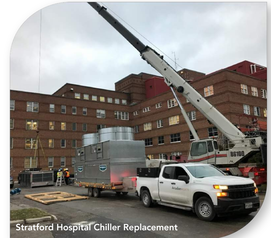
Stratford Hospital Chiller Replacement