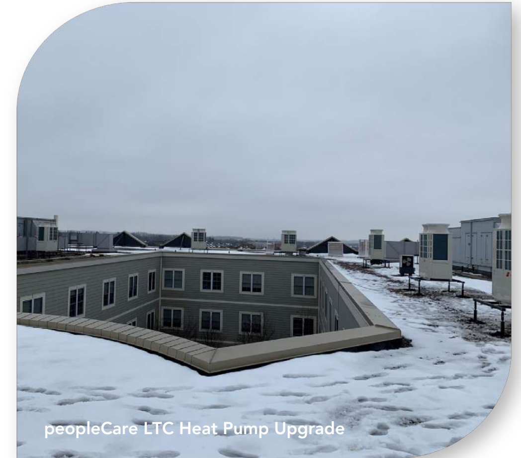
peopleCare LTC Heat Pump Upgrade