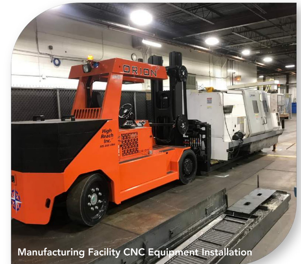
Manufacturing Facility CNC Equipment Installation