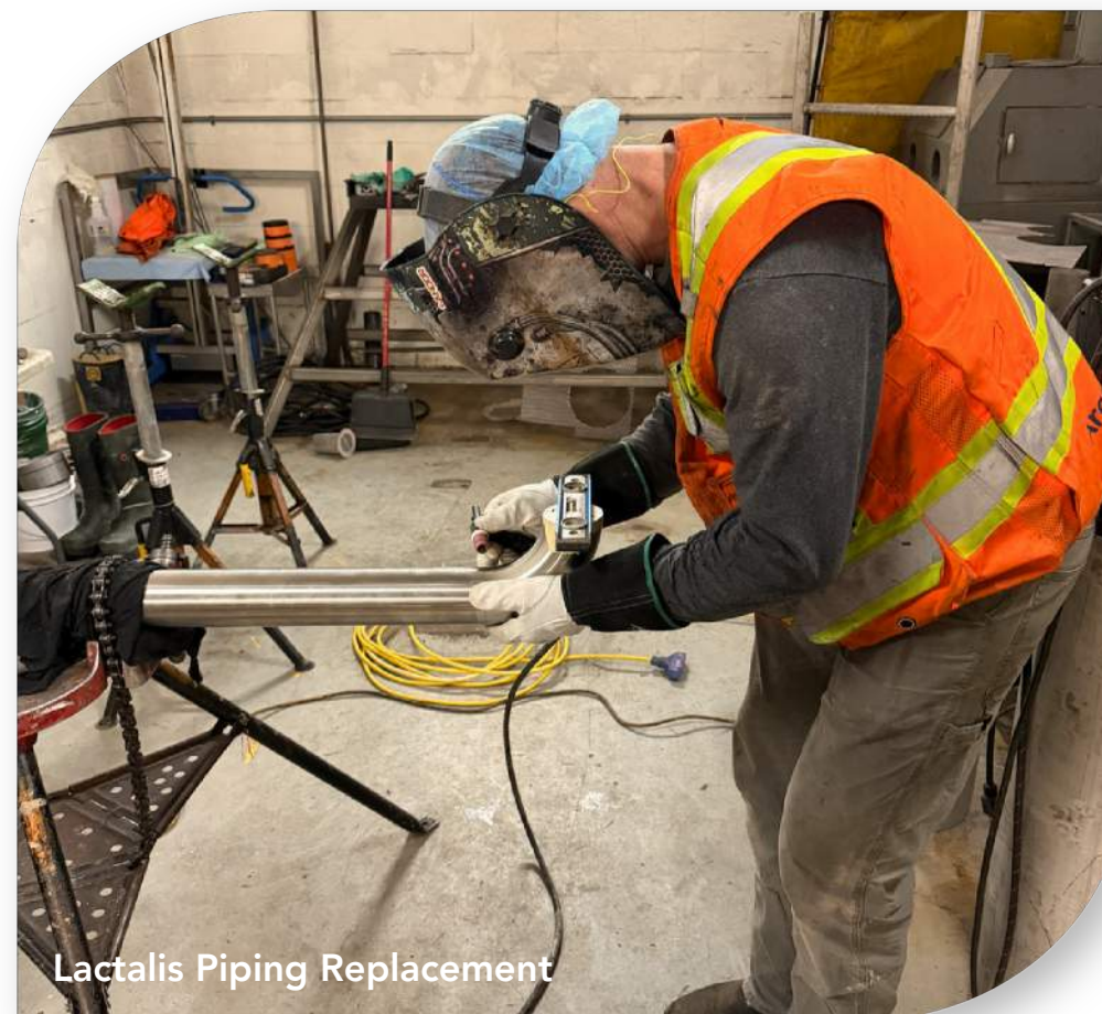
Lactalis Piping Replacement