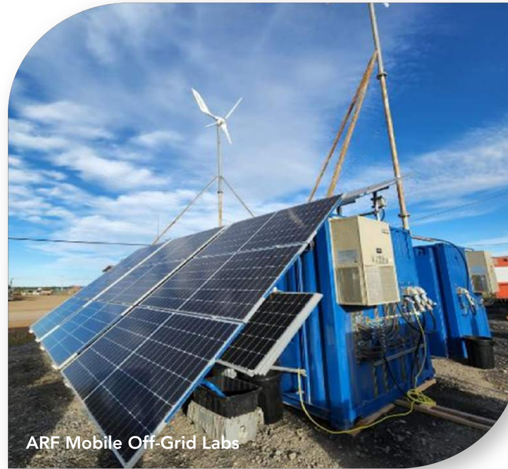
ARF Mobile Off-Grid Labs