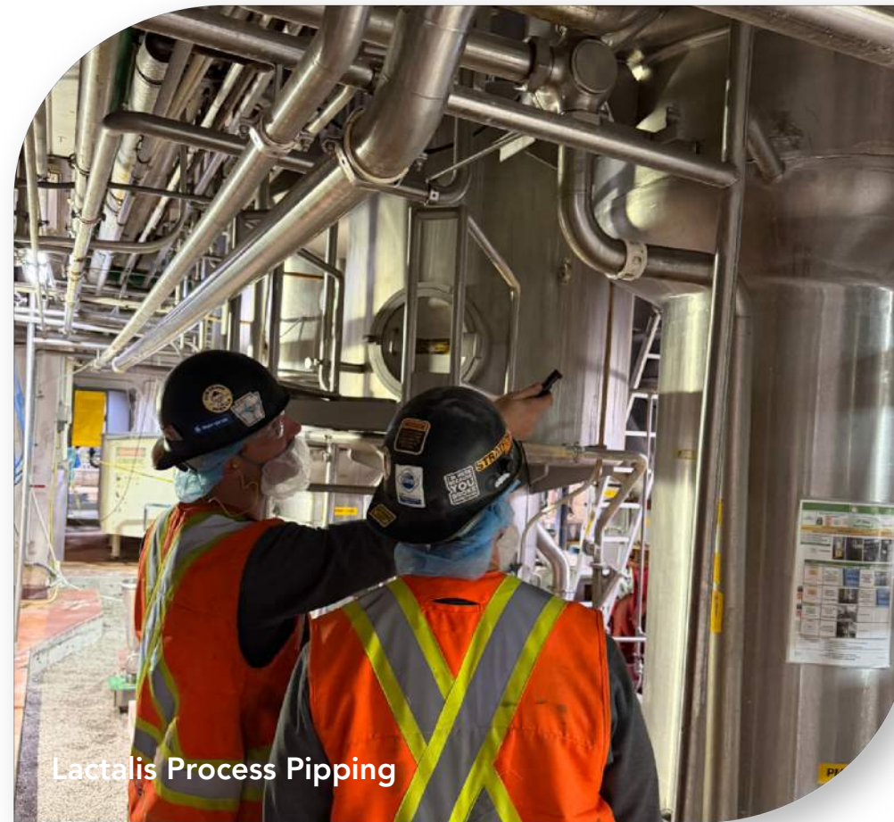
Lactalis Process Piping