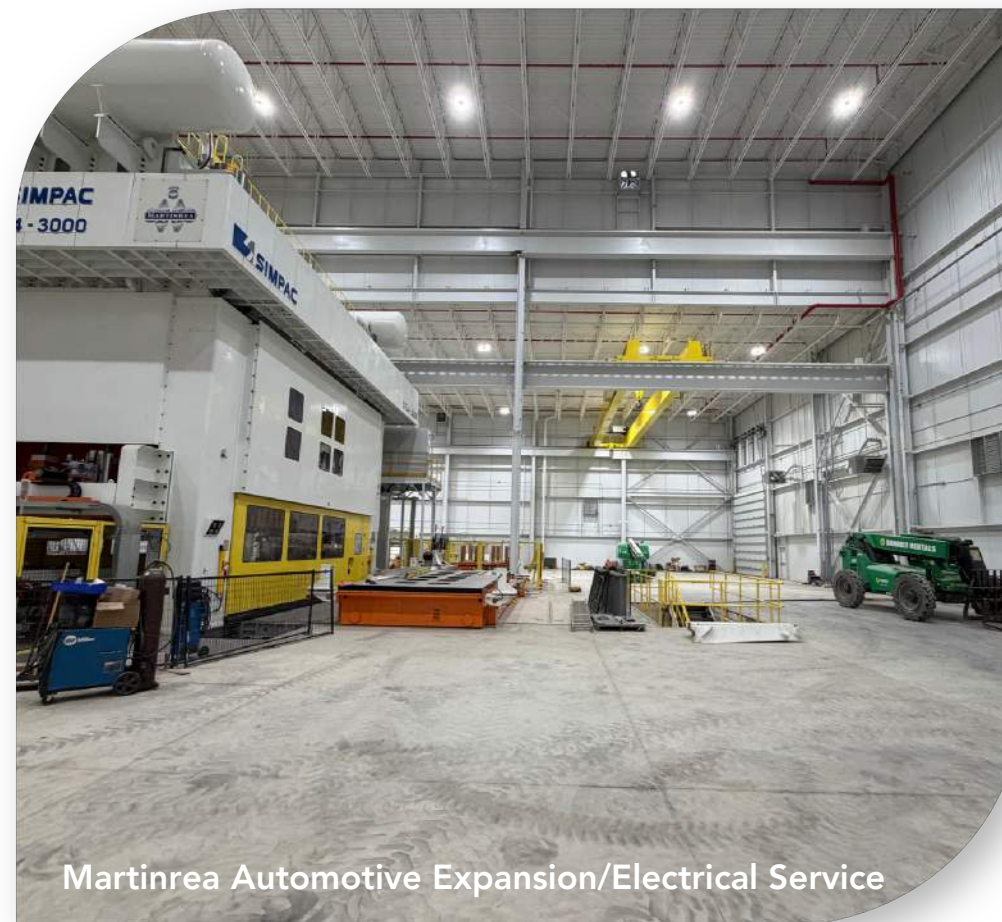
Martinrea Automotive Expansion/Electrical Service