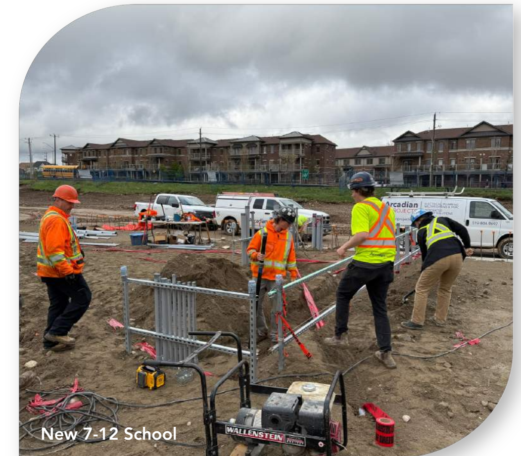
New 7-12 School