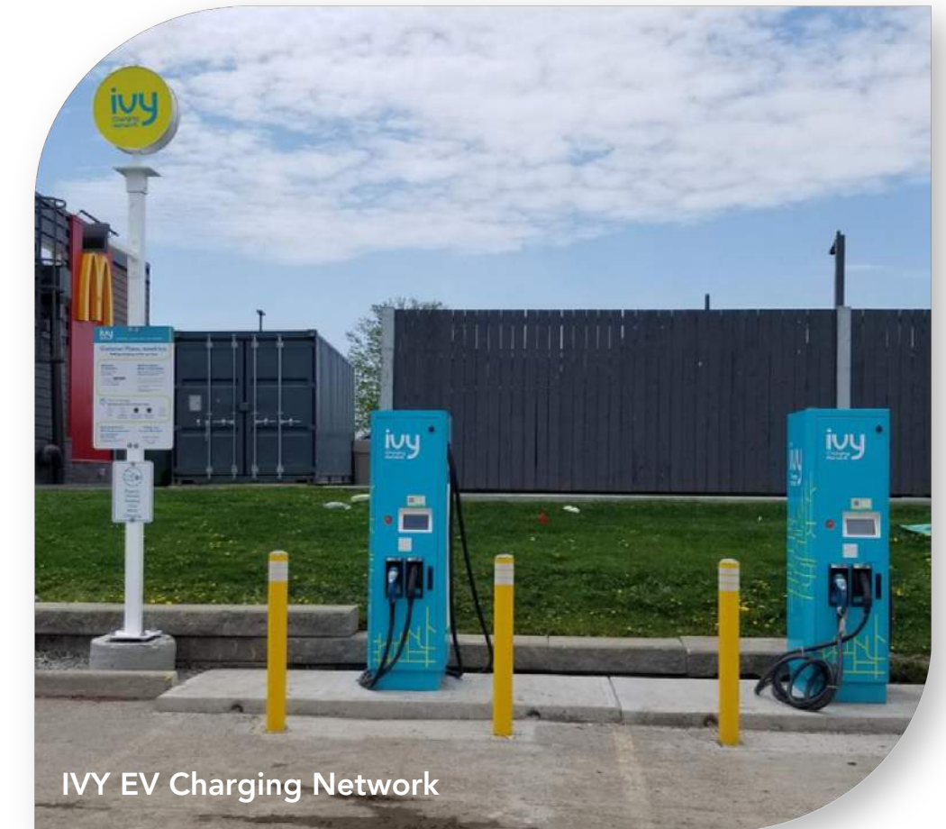
IVY EV Charging Network