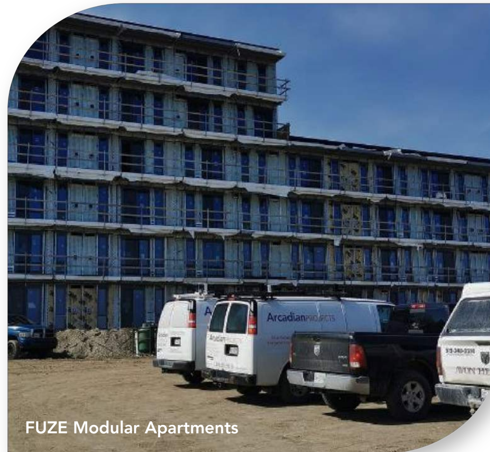
FUZE Modular Apartments